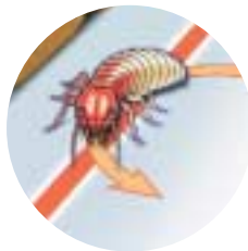
Once exposed to Premise , termites stop feeding and soon die.