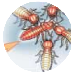
Termites exposed to Premise transfer the product to unexposed colony members through social interaction and cannibalism.