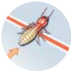
Termites can't detect the Premise Treated Zone