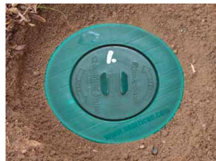
Picture 1: Sentricon RTI station correctly installed sitting flush with the soil surface, also shows station number.

In clay soil ensure the hole is deep enough to allow water to drain out of the Sentricon RTI station .