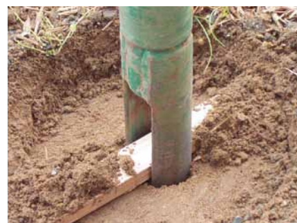
Picture 2: A piece of wood in the auger clearing the soil surface.